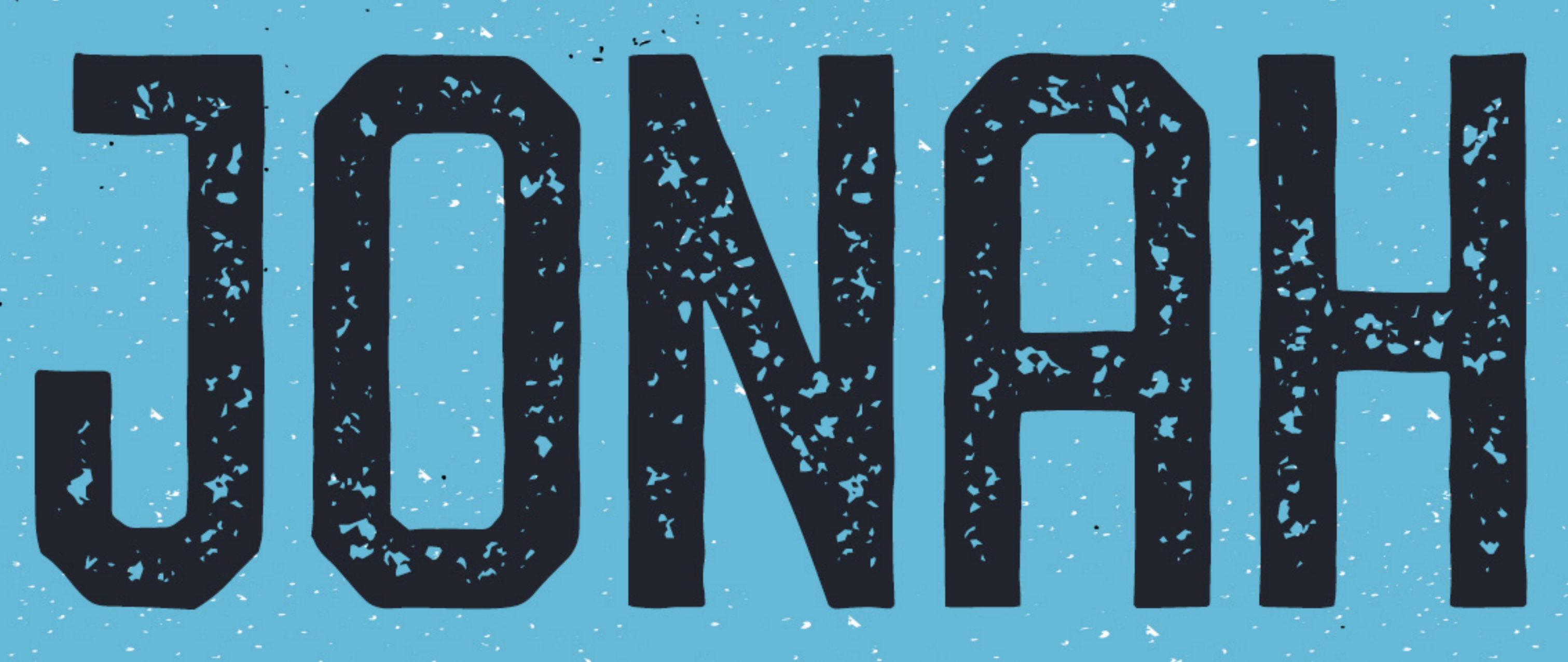
Reluctant Prophet. Relentless God.