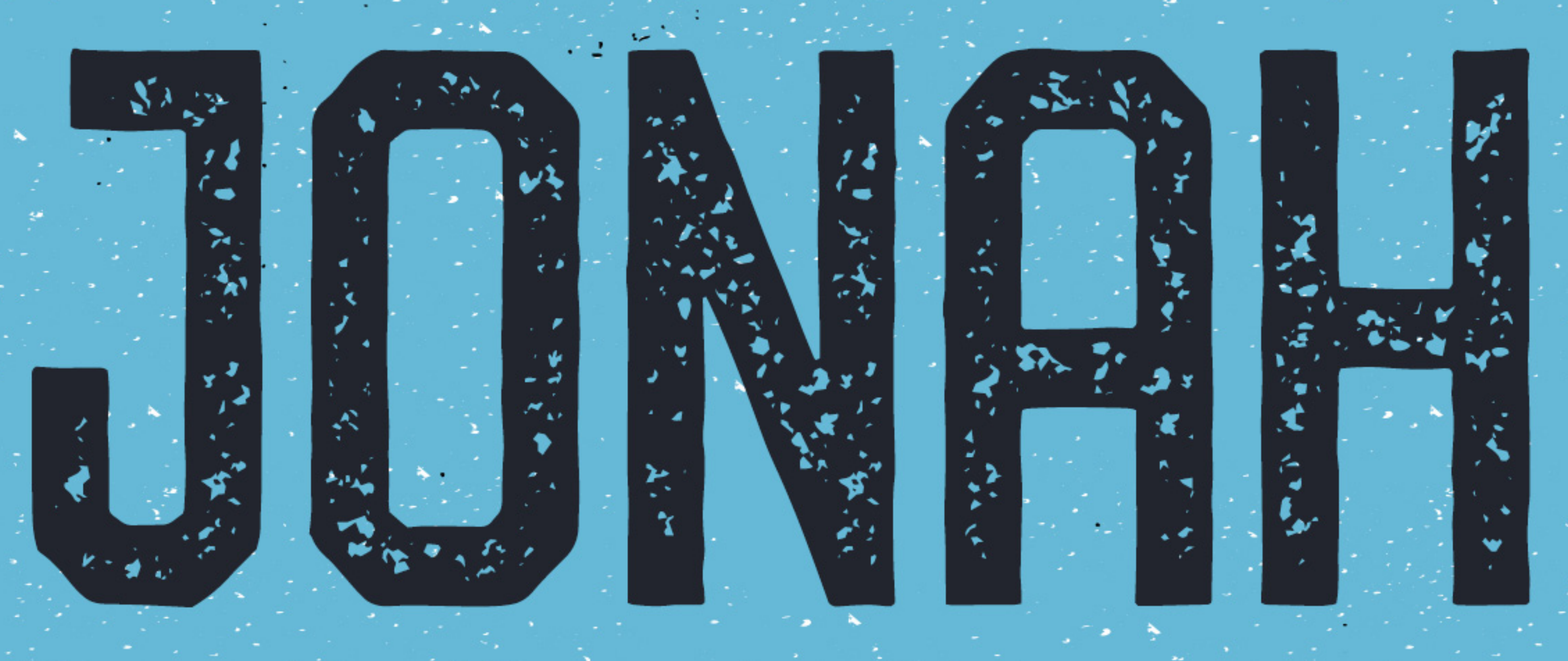
Reluctant Prophet. Relentless God.