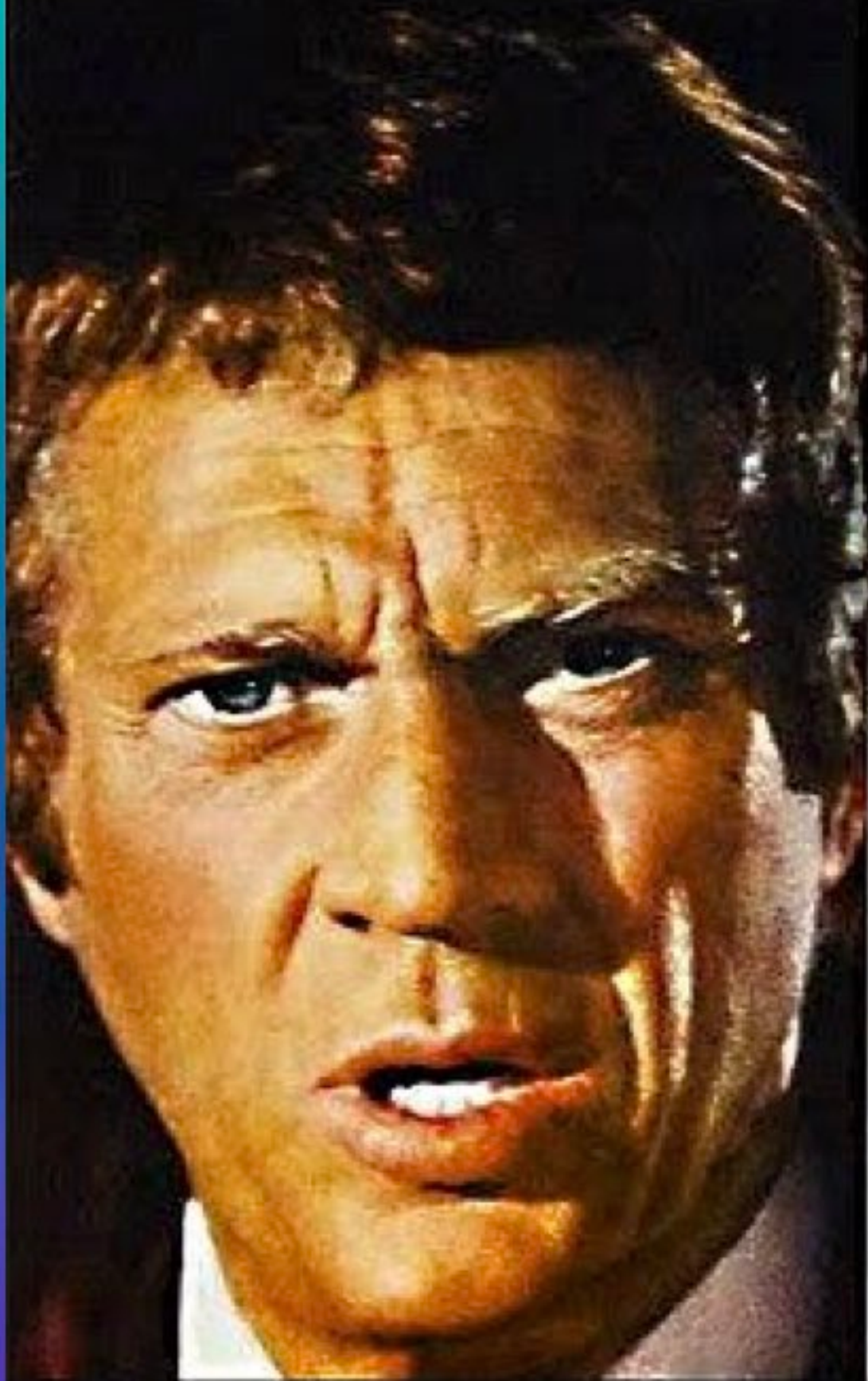
The Fire Chief