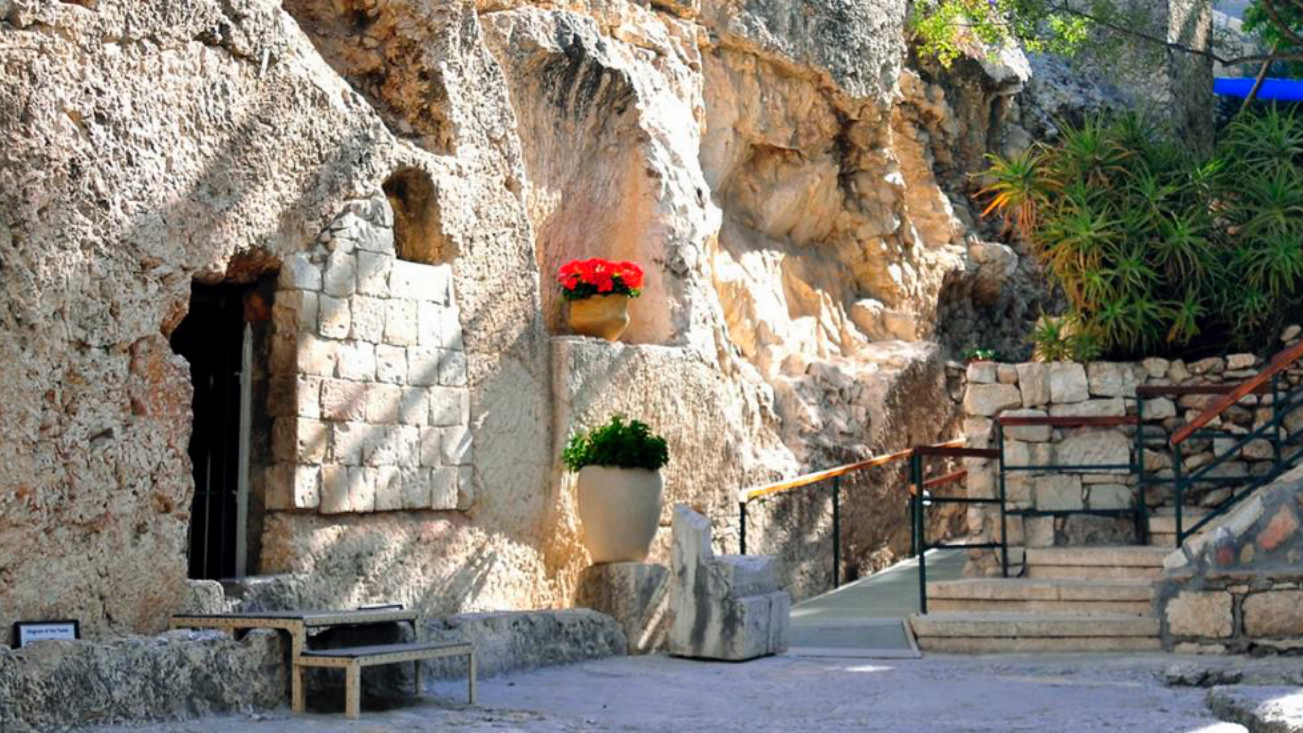
Diagram of the Tomb